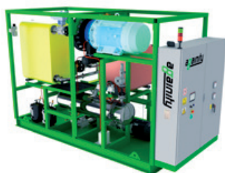
Installed capacity 100 kWe

Againty ORC modules start at 50 kWe and are available up to 2 500 kWe. The modules are easily combined and the maximal power output of a plant hence unlimited. The systems are fabricated and delivered at a high grade of pre-assembly units for short installation and commissioning time at site.