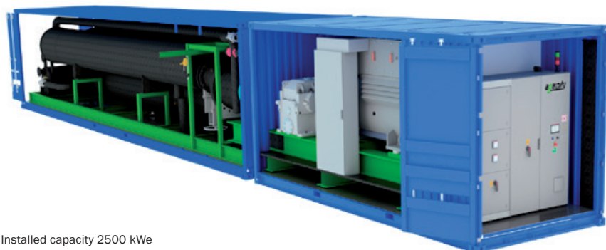
Installed capacity 2500 kWe